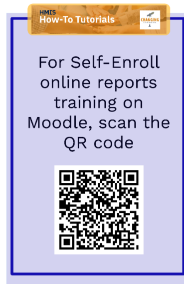
chiedconnect.edu Reports training QR Code

Tutorials on how to run various HMIS reports can be found at chiedconnect.net in the Reports course found in the Self-Enroll Courses section. For more information on how to register for chiedconnect.net as well as other online resources, go to Introduction/Online Resources in the “HMIS Basic User 2025 Manual”