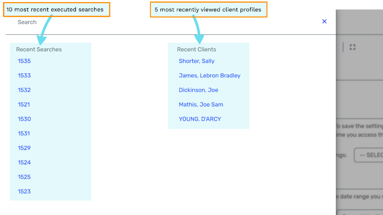
Quick Search Call-out Window

Step 1: To utilize “Quick Search”, click within the box. A call-out window will appear with the past 10 executed searches for Client #s and the 5 most recently accessed client profile names.